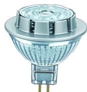
LED low voltage retrofit, RL MR16 50 7,2W/12/WFL/827/GU5.3