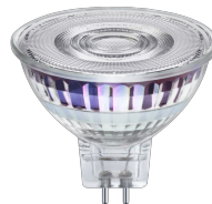
LED Essence low voltage retrofit, RL-MR16 20 827/36°/GU5.3